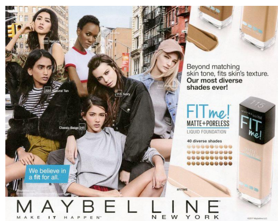
Figure 3. Maybelline Liquid Foundation

The first verbal sign is “Fit Me Matte+Poreless Liquid Foundation”. This verbal sign is the name of foundation product. Liquid textured foundation with a light formula can be used in daily make up, with light to medium coverage so that it looks natural on face. This foundation does not clog pores on the face and contains micro powder which makes skin is shine-free all day long. This verbal sign is categorized as denotative meaning because it shows the benefit of the product with matte and pore less finishing.