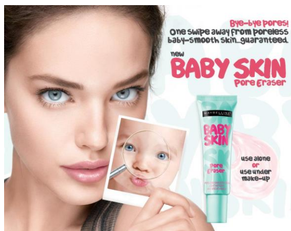
Figure 4. Maybelline Baby Skin

The first verbal sign is “New Baby Skin. Pore Eraser”. The statement tells about the name of the variant product by Maybelline. Baby skin pore eraser is makeup primer to cover skin pore which makes the face become flawless and smooth like a baby skin. It is categorized as denotative meaning because it shows the title of the product which shows the strength of the product.