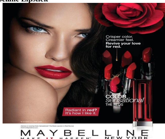
Figure 1. Maybelline Color Sensational the Reds

The first verbal sign is “Crisper color. Creamier feel. Revive your love for red”. Crisp means something sharp, bright, strong, and firm. Crisp is often used to describe colors in print and on various types of monitors/TVs. This is actually a reference to firm, sharp lines between colors, without any blurring or bleeding of tones. Creamy means soft and smooth. So these verbal signs implicitly deliver a message that this product has bright and strong color which in contrary gives creamy feel. It gives soft and smooth effect on lips but with sharp and bright look. It revives the love for red color.